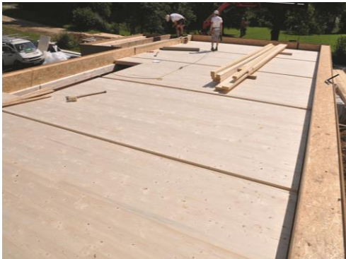
Illustration – ceiling & wall

3-layer board Spruce/C Thickness: 27 mm Width: 150 mm Length: 5 m Delivered in parts only All building products are identified with a standard CE mark according to EN 13986 and EN 13353 or with the national technical approval number Z-9.1-320 issued by the Deutsches Institut für Bautechnik in Berlin (DIBt).